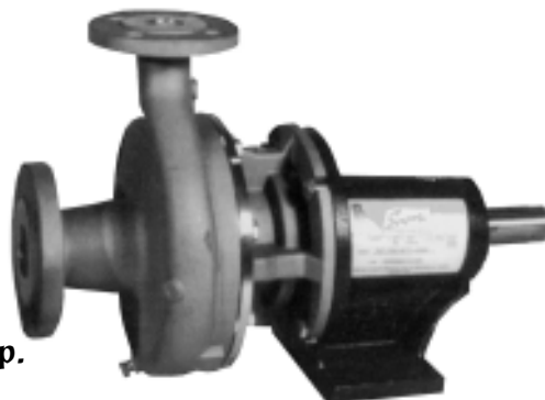
TYPE X CENTRIFUGAL PUMP

Discharge X Suction X Max Imp. XJ100- 1" x 1~1/2 x 8" XJ150- 1~1/2 x 3" x 8" XJ200 - 2" x 3" x 8"