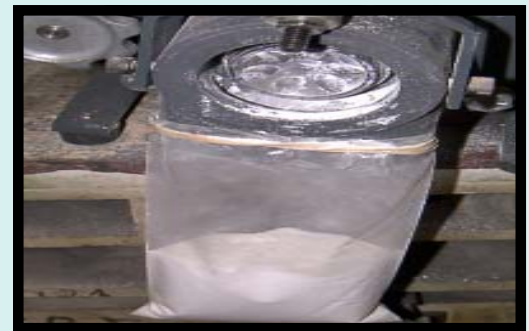
Mini-Pulverizer, Opened for cleaning