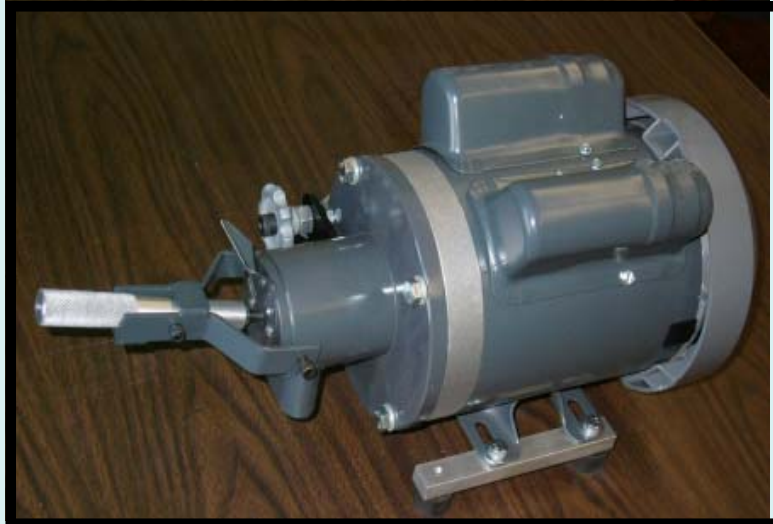
Mini-Pulverizer, End Closed

SEPOR, INC. 718 N. FRIES AVE. P. O. BOX 578 WILMINGTON, 90748 PHONE: 310-830-6601 FAX: 310-830-9336