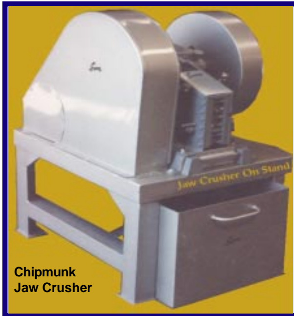
Chipmunk Jaw Crusher

The Chipmunk and Badger Jaw Crushers are capable of reducing friable material, including ore, minerals and chemicals to 1/16". They feature a rugged construction, are designed to absorb shock and impact in constant use applications. All parts are easily accessible. Maintenance is easily accomplished and cleanup is relatively simple and quick. Standard jaw and cheek plates are abrasion resistant steel, however manganese steel plates are optionally available. The discharge opening can be easily adjusted by a handwheel, to easily select the desired product particle size. A feed hopper is included with each crusher, as are flywheel and belt guards.