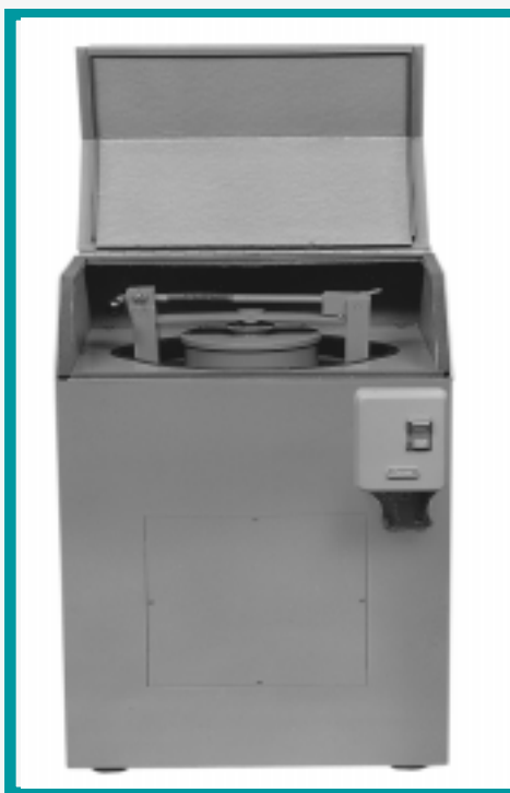
Model VP-1989 Ring Mill