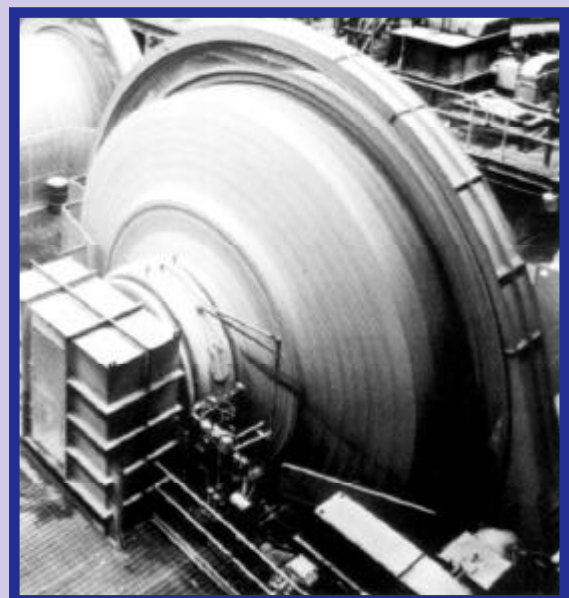
36' X 15' Autogenous Mill

The 6' X 2' continuous feed Autogenous or Semi-Autogenous Mill may be used to scale up results obtained to any of the larger plant operational mills, such as the 36' X 15' Autogenous Mill pictured at right.